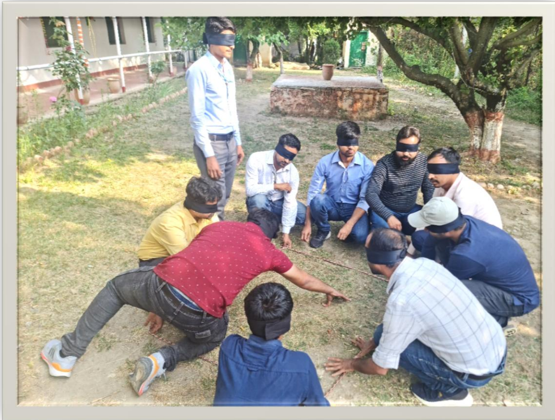
Training Programme on “PRIMAVERA” at CADD Centre, Jammu