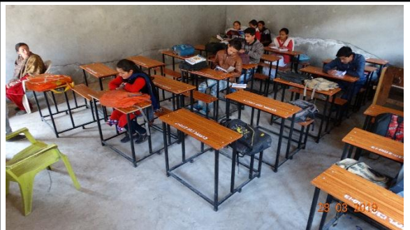
Utilization of items in Govt. High School Cherji