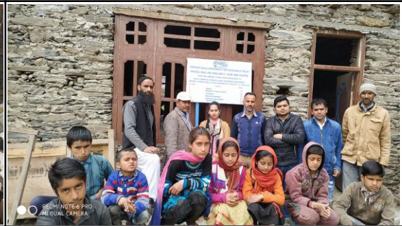
Handing over of items to Govt. Middle School Arzi, Zone Nagseni