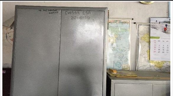
Utilization of items in Govt. High School, Galhar Bhata