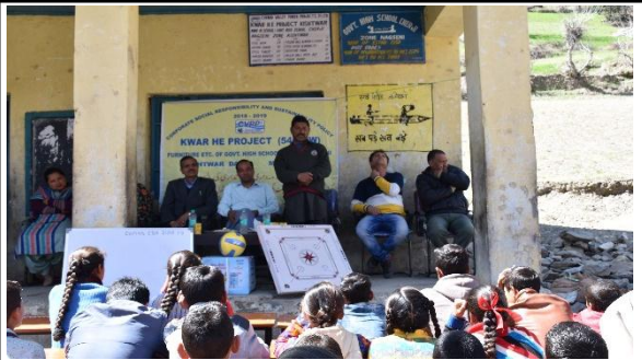
Handing over of items to Govt. High School Cherji