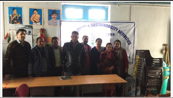
Handing over of items to Govt. High School, Galhar Bhata in presence of Naib Tehsildar, Nagseni