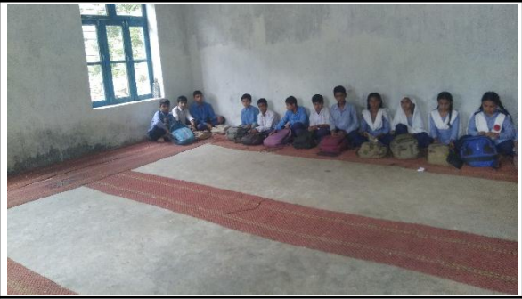
Govt. High School, Galhar Bhata depicting pre activity scenario