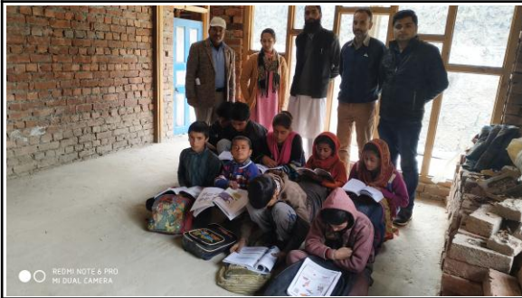
Govt. Middle School Arzi, Zone Nagseni depicting pre activity scenario