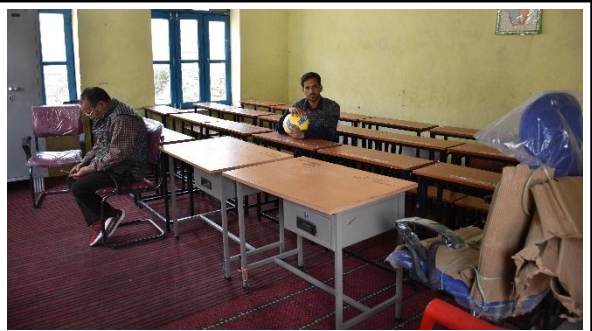
Handing over of items to Govt. Middle School Kwar