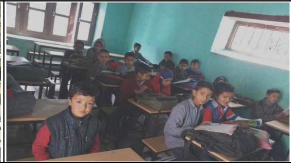
Handing over of items to Govt. Middle School Janakpur, Dachhan and utilization of items in the school