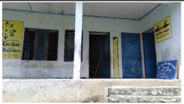
Govt. Primary School Champli (Badole) depicting pre activity scenario