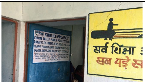
Utilisation of items in Govt. Primary School Champli (Badole)