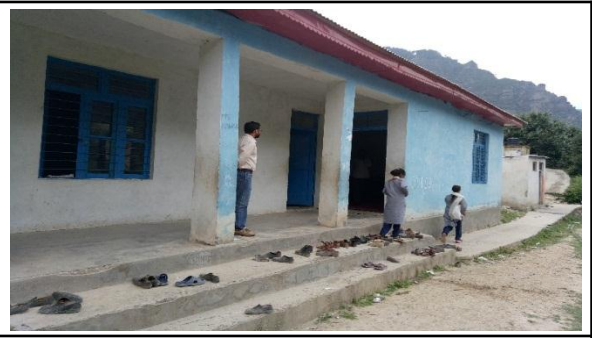
Govt. Middle School Kwar depicting pre activity scenario