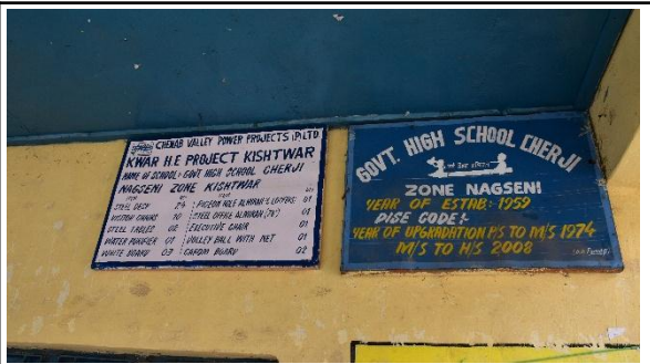
Handing over of items to Govt. High School Cherji