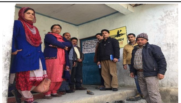
Handing over of items to Govt. Primary School Champli (Badole)