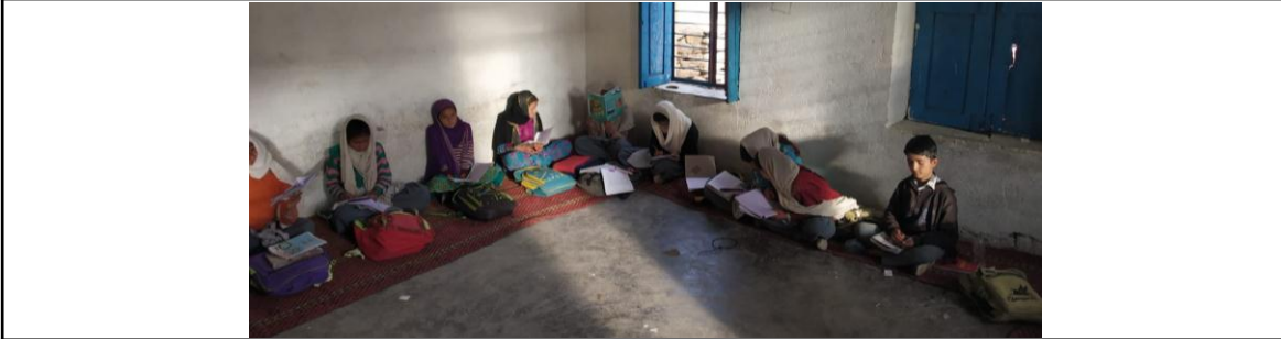
Govt. Middle School Janakpur, Dachhan, Kishtwar depicting pre activity scenario