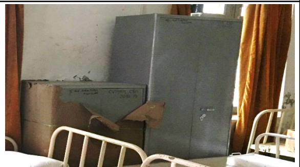
Handing over of items to Primary Health Centre Kiru in presence of Naib Tehsildar, Tehsil Nagseni and Medical Officer, PHC Kiru