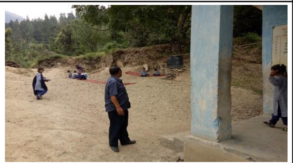
Govt Middle School Upper Bidda depicting pre activity scenario