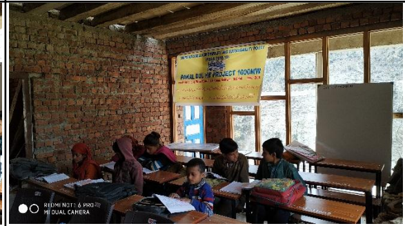
Handing over of items to Govt. Middle School Arzi, Zone Nagseni and utilization of items in the school