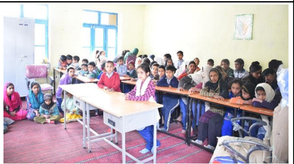
Handing over of items to Govt. Middle School Kwar