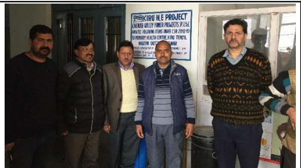
Handing over of items to Primary Health Centre Kiru in presence of Naib Tehsildar, Tehsil Nagseni and Medical Officer, PHC Kiru