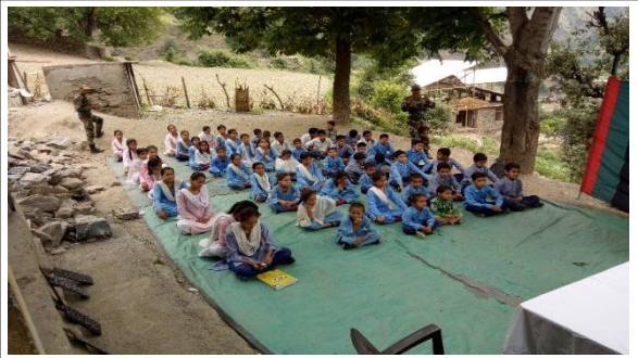
Govt. High School Cherji depicting pre activity scenario