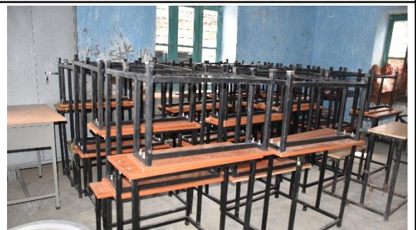
Handing over of items to Govt Middle School Upper Bidda