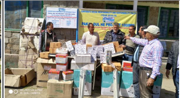
Handing over of items to Block Medical Office, Dachhan