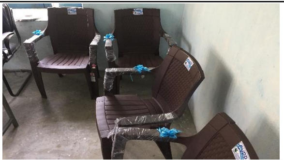
Utilisation of items in Govt. Primary School Champli (Badole)